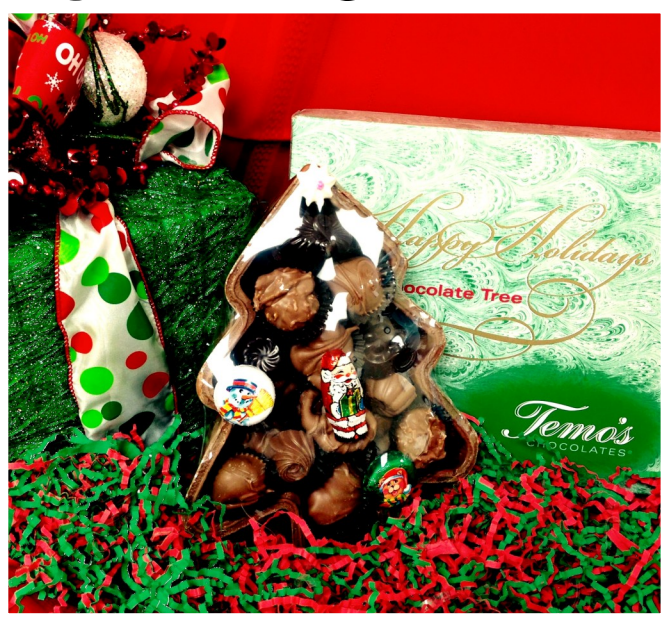
Christmas Temo's are Here! Waggoner's Assorted Chocolates and The Peanut Shoppe's boxed nuts are also available!