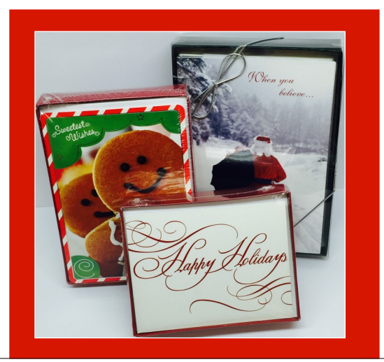
Christmas cards are in! 50% Off Stop by the pharmacy to check out the different designs!