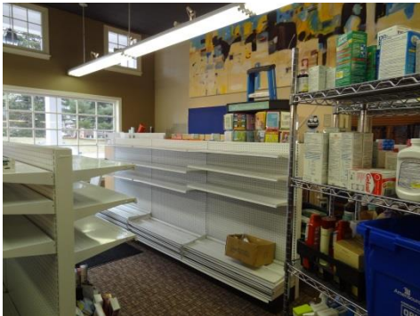
Left: Some of the renovation in process

Come in to see the amazing new look to Sand Run Pharmacy.